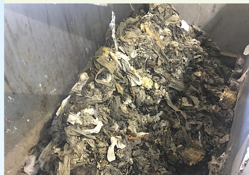
Used “flushable” wipes and other items removed from a sewer in Clinton Township by the Macomb County Public Works Office.